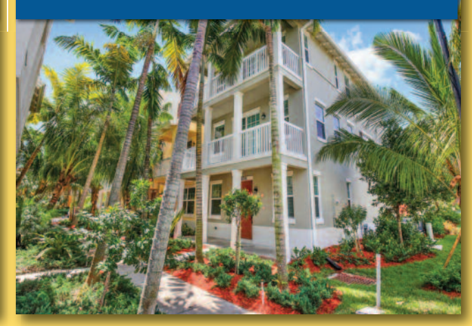
100A W. Coda Circle • Coda Brand new, upgraded, 3 bedroom, 3.5 bath unit with 2-car garage. Offered at $619,000.