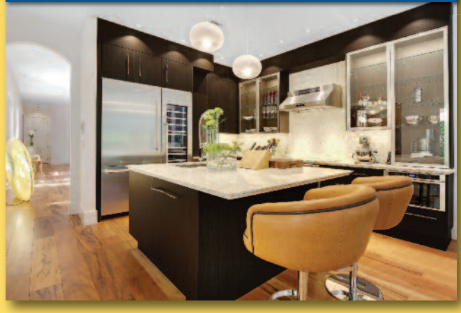
260 E Boca Raton Road • The Indies 3 bedroom, 3.5 bath, 2-car garage, private pool and yard with 3,009 sq. ft. of living space! Offered at $1,300,000.