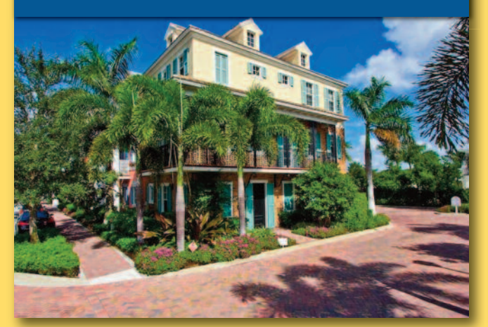
121 Lily Lane • Cannery Row 3 bedroom, 3.5 bath, 2-car garage, 2 balconies, and 2,699 sq. ft. of living space! Offered at $975,000.